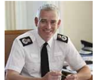
Top photograph - Julia Mulligan - Police & Crime Commissioner